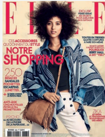
2016: "UN TRAITEMENT REVITALISANT SANS AIGUILLE"