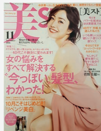
2016: "LO SPECIALE MASSAGE PEEL CHE VIENE DALL'ITALIA: CONOSCIUTO A GENNAIO, È STATO SUBITO COLPO DI FULMINE"