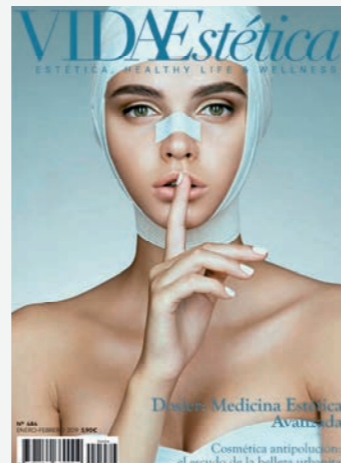
2019: "LE NOVITÀ IN ARRIVO"