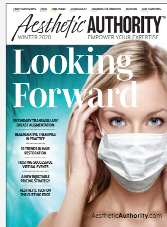
2020: "MY JOURNEY TO EVIDENCE-BASED RESULTS: PRX-T33 / MICRONEEDLING IN COMBINATION FOR PORES AND SCARS."