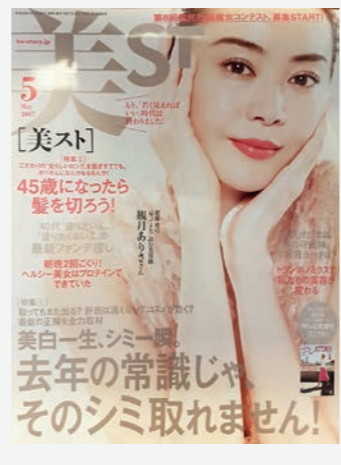
2017: "USAKO FLEW TO ITALY TO MEET WITH MRS. MASSAGE PEEL!"