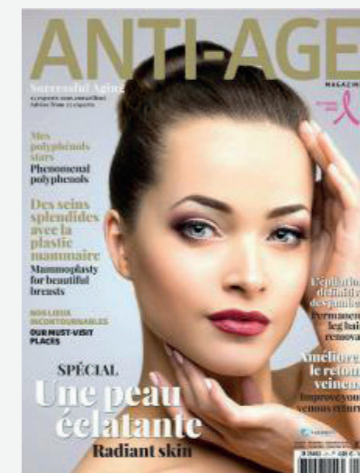
2016: "COLLAGEN BOOSTER" CELL REGENERATION PROCEDURE