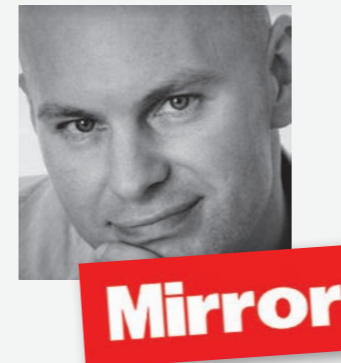
2017: "THE REVOLUTIONARY NEW LUNCH TIME FACE PEEL THAT WILL TAKE YEARS OFF YOU - AND DOESN'T REQUIRE DOWNTIME"