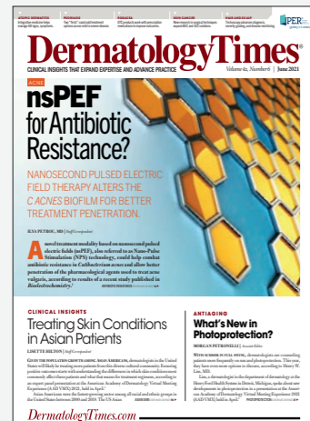
2021: "PRX-T33: A VERSATILE TOOL TO COMBAT AGEING IN HIGH-PHOTOTYPE SKIN"