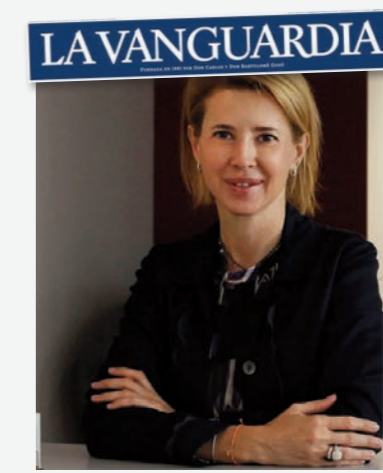
2016: "EL PRX-T 33 CONSIGUE ESTIMULAR LA DERMIS DE FORMA NO INVASIVA"