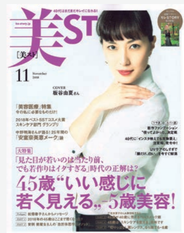
2018: OUTSTANDING TREND: "MESSAGE PEEL," PRX-T 33