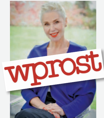
2014: "ESTETYCZNE PRZEBOJE ROKU"