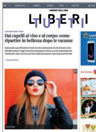
2018: "DAI CAPELLI AL VISO E AL CORPO: COME RIPARTIRE IN BELLEZZA DOPO LE VACANZE"